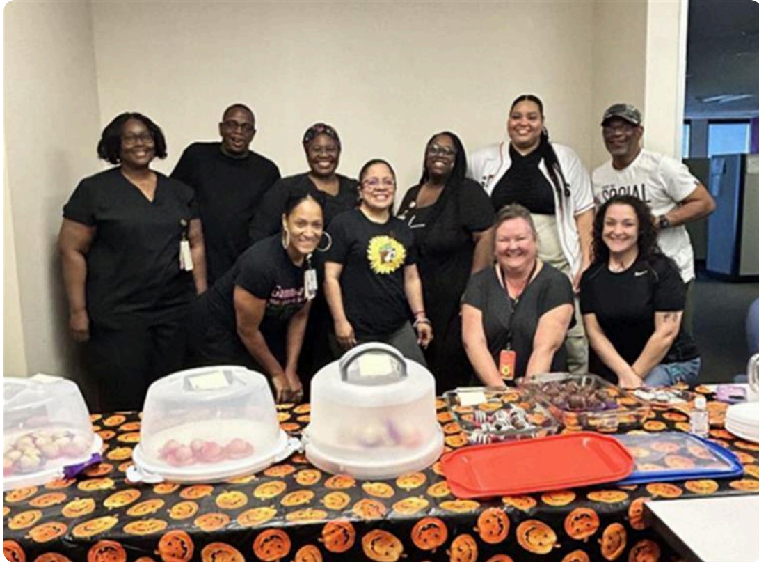
PCC FLUSHOT EVENT 10/14/2023